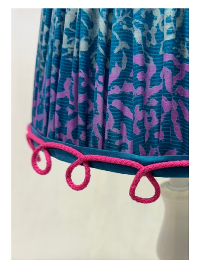
Here's a few gathered shades that students have made in recent 1-2-1 workshops